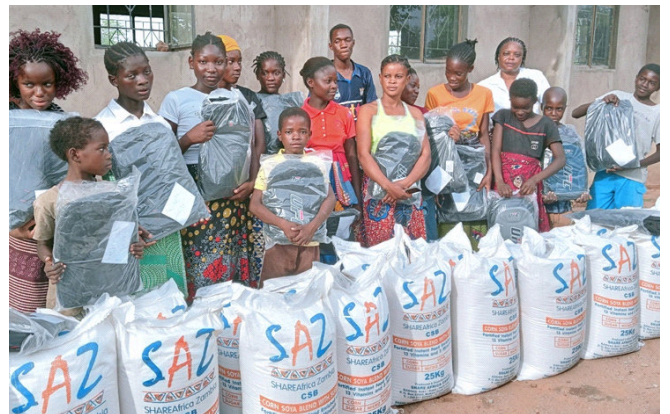
Children in Kambimbi receive corn soya blend on 14th December 2023. Each household received 2 bags

The Corn Soya Blend is a highly nutritious precooked breakfast porridge with is made in the SAZ factory. The specification is a World Food Programme recipe recommended for malnourished children. There is a noticeable difference in the health of the children after taking the CSB.